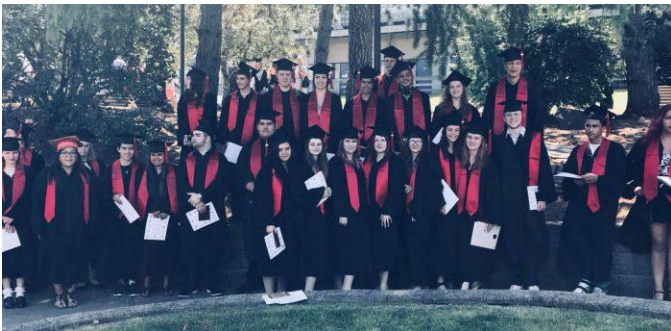
Learning Alternatives Grad Class of 2018.

Graduation photos will be taking place in April. Students that are in a position to graduate will have the cost of the photo shoot covered. This will give them access to two digital copies that can be used to share with friends and families online or be taken into a photo center for copies. More information will be provided at the Grad 2019 Meeting on February 20.