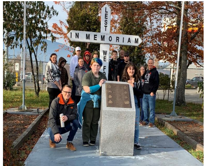
Students and staff taking a moment to remember.