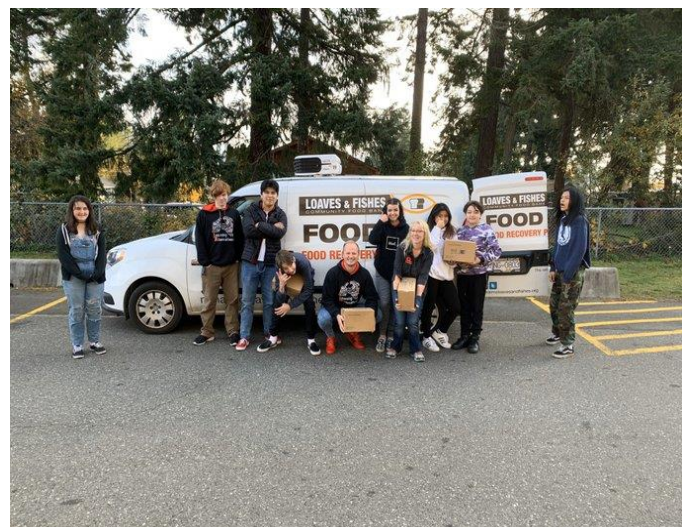
Our students and staff thanking the generosity from Loaves and Fishes and Nanaimo Ladysmith Schools Foundation for all their support.